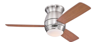
Reversible Dark Cherry Finish Blades